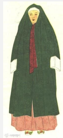
Figure 4: Jangot