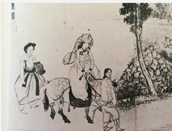
Figure 1: Cloack-shaped veil