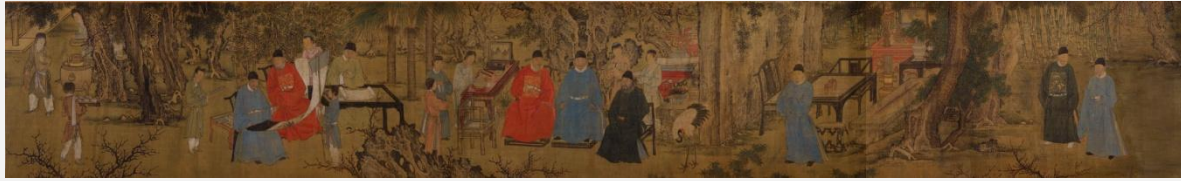
Figure 3: Painting of Xie Huan (1370-1450) entitled elegant gathering in the Apricot garden

Source: China Online Museum Website, http://www.chinaonlinemuseum.com/painting-xie-huan-apricot-garden.php , accessed in 2015