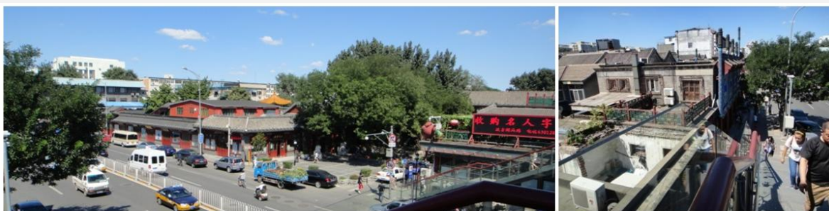
Figure 4: Bird-eye view of Liulichang art district: the interventions are done directly on the former building structures

The former cultural streets on the east and west that meet at the main intersection on the urban road have been restored according to its former neighbourhood street atmosphere. Old willow trees were remained along the street and encased with concrete block on which people can sit and relax. The