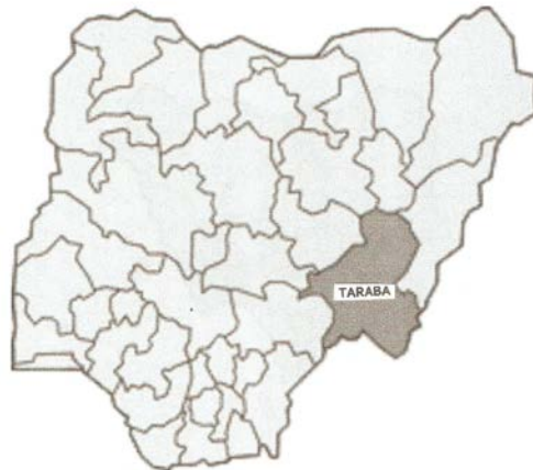
Plate 1: Map of Nigeria showing Taraba State.

In order to widen the scope of action, the Nigerian government launched the President’s Comprehensive Response Plan (PCRP), to reinvigorate the national HIV/AIDS response in Nigeria and increase domestic spending on the response. On full implementation, the PCRP is projected to reduce by 40% new HIV infections (translating into 210,000 new infections averted annually), increase by 100% of number of persons receiving ART to more than one million, reduce by 21% the number of AIDS death to 115,000 annually (translating into 92,000 deaths averted) and reduce by over 80% reduction in mother to child transmission (Idoko, 2014).