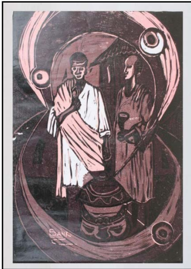
Plate 1: Transferring of Monarchical Authority

The King is seen in white garment holding the heart of the former king in his hand while the chief priest is looking at him performing this rite (Plate1). In front of them is the pot inside where the heart is being kept. The colours used for the visual are cool and the two men in the print are in