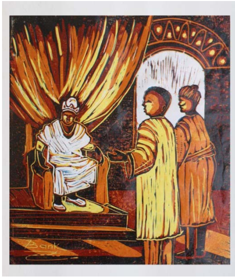
Plate 9: The Judgments

Among the monarchical activities of the King is delivery of Judgment. He is seen as the Chief Judge within the jurisdiction of his authority. Those who were accused of robbery, kidnapping, murder, possessing of dangerous medicine and practice witchcraft were brought to the king in his palace for judgement. In an attempt to maintain security and avoid jungle justice from the perceived aggrieved people in the community, his intervention is sought as quickly as possible (Plate9).