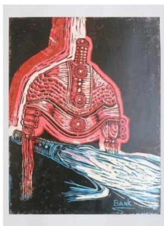
Plate 5: Symbol of monarchical office

Depending on the wealth of the king, a royal family can own many crowns of different shapes. Some of these may be modern and others antiquity. As represented in the print, many crowns are completely covered with ancient coral beads. The crown in the picture is called layer type of crown. It is fully a beaded crown rendered in brisk red against a dark background. Under it is the cow's tail referred to as irukere in Yoruba language, which is usually spotless white. This symbolizes peace and grace. It is an important dress regalia, which the king carries at all time. Ford and Christine(2012),outline guides on print making provided a significant insight into the various production techniques adopted for these prints. This combination of different media, which brings one design technique on top of the other as exhibited on this print, makes identification of a particular method somewhat difficult (Oladumiye 1999)