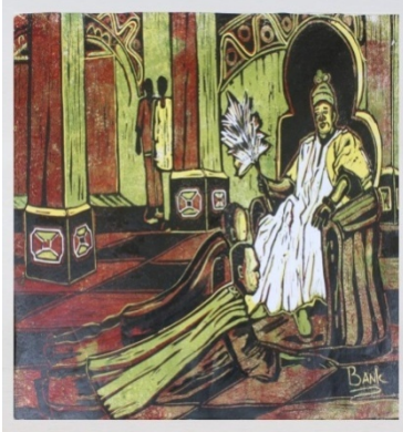
Plate 7a: Men Pay Tribute to the King as an Authority Source: Emmanuel BankoleOladumiye; Research 1999 Medium: Mixed media (Rubber relief print), Colour: Courtesy the Artist

Plate 7a depicted the king sitting on his throne. The palace was built with ancient pillars with traditional motifs and the top of the throne is adorned with beautiful motifs. The king is seen as the father of all and the representative of the gods on earth. In the Yoruba culture, respect for the king is