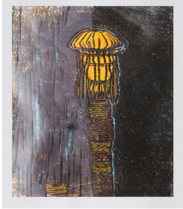
Plate 6: A Staff of Symbol of Monarchical Authority Source: Emmanuel BankoleOladumiye; Research 1999 Medium: Mixed media (Rubber and Pantograph relief print), Colour: Courtesy the Artist

The beaded staff is a sign of authority in the monarchical role of the king. Wherever the king cannot go he has the right to send its staff and the staff also served as a messenger of authority of the king or the representative of the king's generalissimo. It is an important staff of office of the king.