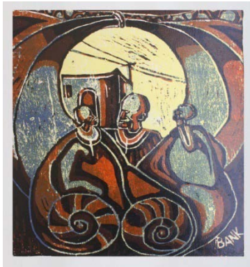
Plate 8: Monarchical Unity of the chiefs Source: Emmanuel Bankole Oladumiye; Research, 1999 Medium: Mixed media (Wood Relief), Colour: Courtesy the Artist

The Yoruba system of government is extremely complex and might appear confusing to outsiders in the sense that the king is not an absolute ruler. His powers are checked in a number of ways and more importantly, he did not rule single handedly but in conjunction with a council of elders or chiefs.