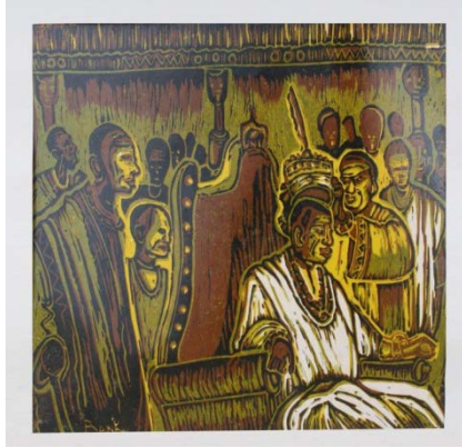
Plate 3: Investiture with regal of Monarchical power Source: Emmanuel Bankole Oladumiye; Research, 1999 Medium: Mixed media (Rubber relief and print), Colour: Courtesy the Artist Instrument of power