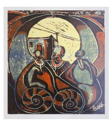
Plate 8: Monarchical Unity of the chiefs

The Yoruba system of government is extremely complex and might appear confusing to outsiders in the sense that the king is not an absolute ruler. His powers are checked in a number of ways and more importantly, he did not rule single handedly but in conjunction with a council of elders or chiefs.