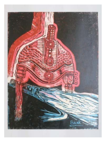
Plate 5: Symbol of monarchical office

Depending on the wealth of the king, a royal family can own many crowns of different shapes. Some of these may be modern and others antiquity. As represented in the print, many crowns are completely covered with ancient coral beads. The crown in the picture is called layer type of crown. It is fully a beaded crown rendered in brisk red against a dark background. Under it is the cow's tail referred to as irukere in Yoruba language, which is usually spotless white. This symbolizes peace and grace. It is an important dress regalia, which the king carries at all time. Ford and Christine(2012),outline guides on print making provided a significant insight into the various production techniques adopted for these prints. This combination of different media, which brings one design technique on top of the other as exhibited on this print, makes identification of a particular method somewhat difficult (Oladumiye 1999)