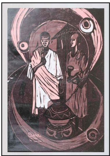
Plate 1: Transferring of Monarchical Authority

The King is seen in white garment holding the heart of the former king in his hand while the chief priest is looking at him performing this rite (Plate1). In front of them is the pot inside where the heart is being kept. The colours used for the visual are cool and the two men in the print are in