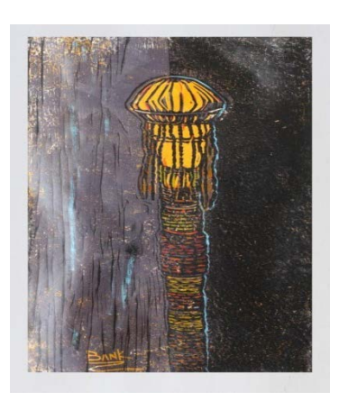
Plate 6 : A Staff of Symbol of Monarchical Authority Source: Emmanuel BankoleOladumiye; Research 1999 Medium : Mixed media (Rubber and Pantograph relief print),

The beaded staff is a sign of authority in the monarchical role of the king. Wherever the king cannot go he has the right to send its staff and the staff also served as a messenger of authority of the king or the representative of the king's generalissimo. It is an important staff of office of the king.