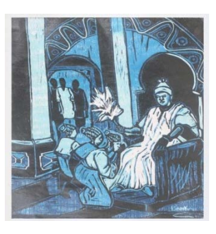
Plate 7b : Women Pay Tribute to the King as an Authority Source: Emmanuel BankoleOladumiye; Research 1999 Medium: Mixed media (Rubber relief print), Colour:Courtesy the Artist