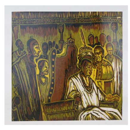
Plate 3 : Investiture with regal of Monarchical power Source : Emmanuel Bankole Oladumiye; Research, 1999 Medium : Mixed media (Rubber relief and print),

Colour: Courtesy the Artist Instrument of power