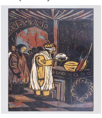
Plate 2: Determination of Destiny

The destiny is tested here by trying the Kings faith and asking him to choose one out of the items kept in the basket, which would determine his monarchical rule as the king of the town. That is, salt, honey, pepper, gun, cutlass and snail. Calabash of salt and honey signify pleasant governance and prosperous administration accompanied with prosperity in the town. The choice of pepper, cutlass, andgun predicts evil reign, which might be associated with war, bad omen, while snail is meant for peace in the town. (Oladumiye and Kashim2013).