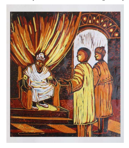
Plate 9: The Judgments

Among the monarchical activities of the King is delivery of Judgment. He is seen as the Chief Judge within the jurisdiction of his authority. Those who were accused of robbery, kidnapping, murder, possessing of dangerous medicine and practice witchcraft were brought to the king in his palace for judgement. In an attempt to maintain security and avoid jungle justice from the perceived aggrieved people in the community, his intervention is sought as quickly as possible (Plate9).