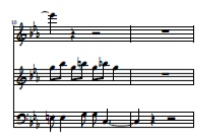
Figure 5. Early songah musical notation

Although as time goes by many foreign cultures come to influence Indonesian local cultures, songah is not necessarily eliminated. The artists together with the songah art community continue to make efforts to develop songah music to keep up with the times and the musical development. The efforts can be seen in the gradual inclusion of other musical instruments to accompany songah, such as the kecapi, suling, tarawangsa, and violin, popularly known among the public and connoisseurs of art as a collaborative songah orchestra. The development has made songah appropriate to be performed in helaran (festivals) and carnivals in Sumedang. Songah composition in western tonal scores is as displayed in Figure 6: