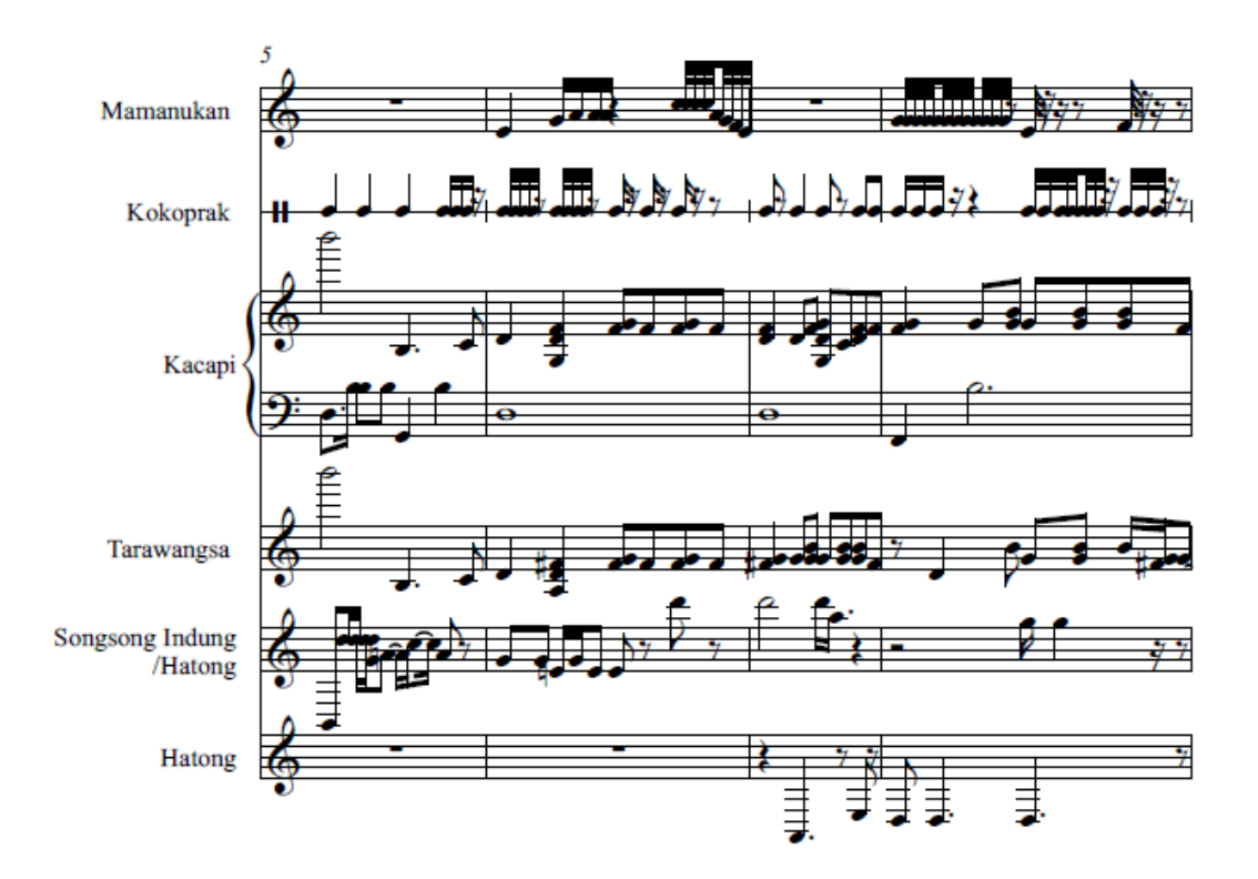
Figure 6. Songah Etnik (Orchestra) "Sumedang Kota Kamelang"

The entire songah instruments serve as a rhythm that can accompany and add to the repertoire of lively sounds, while the melody is produced by kecapi and suling. Songah performances become more attractive when playing popular songs, including "Sumedang Kota Kamelang", a song that tells about the beauty of Sumedang City that has made anyone reluctant to leave the city. The song also stresses the promise of the Sumedang people that should not be abandoned, which is to build the City.