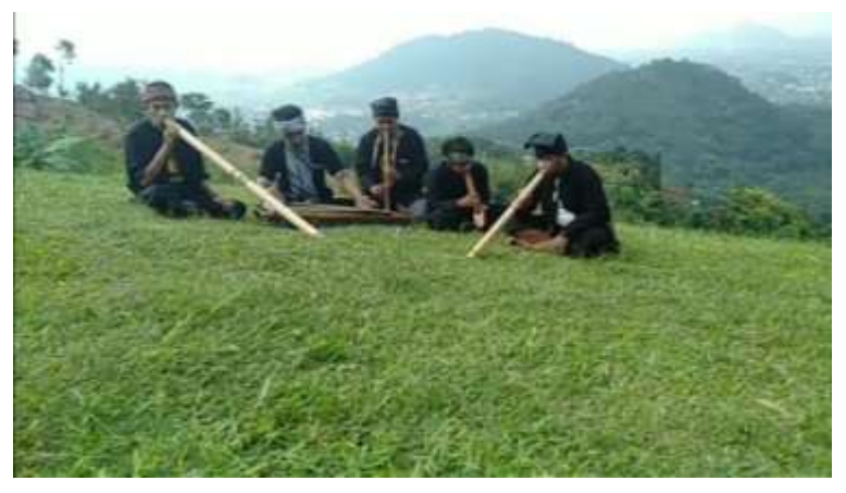
Figure 2. Songah performance at Panggung Alam.

In line with the times, songah continues to experience changes and development not only in its physical form, but also in the way it is performed and passed on to the next generations. Songah still takes the original form of a songsong (furnace blower). However, the function of songsong has changed from a cooking tool into a performing art. The change of function in songah also affects the changes in the meaning of the art. As a household tool used by the community in daily life, it is rich in the value of local wisdom. The household tool is then played together as a musical instrument to create a musical composition. The meaning of songah develops not only in the domestic or local realm but also globally. From a tool initially used individually to a musical instrument played collaboratively as a globalized art, songah has become one of the nationally famous tourism attractions. Songah performance is included in the arts festival held by the local tourism office as shown in Figure 2.