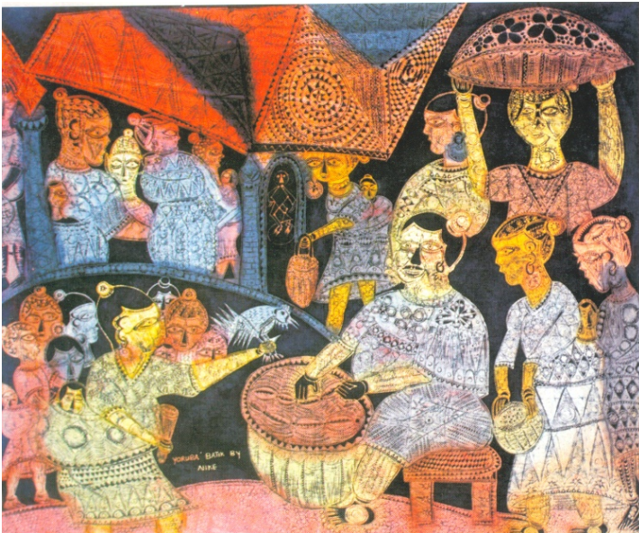
Plate 4 Village scene. By Nike Okundaye (1968). Batik Wall hanging in synthetic colours. Catalogue; Celebrating an Icon at Fifty Five 2006. p.12