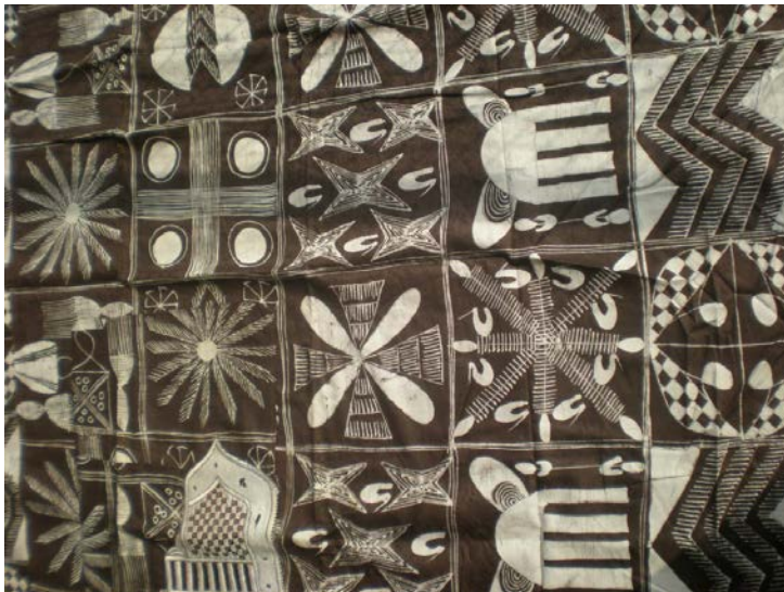
Plate 2 Batik (wax resist)with traditional motifs and dyed in synthetic brown dye. From Nike Gallery in Osogbo. Photograph by GbemiAreo. 2005.