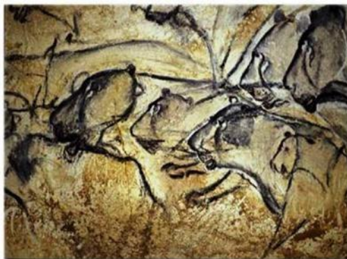
Figure 1. Chamber of Lions , Cave of Forgotten Dreams , 2010

("Fighting Rhino and Horses," n.d.) (Figure 2). These insights of the thoughtful processes involved in the making of the images indicate their importance to the people who made, and interacted with,