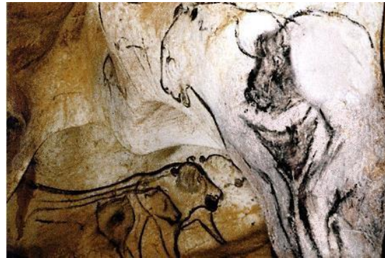
Figure 6. Venus Pendant/the Sorcerer , Chauvet Cave Paintings Gallery, Bradshaw Foundation

On the basis of the above observations, the following list includes the basic elements that constitute the proto-cinema in the cave: 1) Darkness and light 2) Defined enclosure 3) Settings 4) Paintings and the sense of moving images and animation 5) Performative actions 6) Storytelling 7) Interplay of lights and shadows 8) Colors 9) Sound/music 10) Myth-making, supernatural and shamanic visions and 11) The participation of a community.