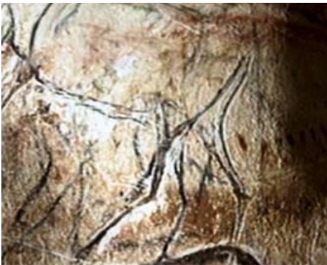
Figure 3. Bison with eight legs, Cave of Forgotten Dreams , 2010

To convey the illusion of movement, the Paleolithic painters added multiple legs to animals to induce a motion effect, for instance, a bison with eight legs, illustrating the animal’s movement (Figure 3). It is the same basic principle utilized by Eadweard Muybridge in order to animate an image of a galloping horse through a succession of photos (Muybridge’s The Horse in Motion , 1878), (Prodger & Gunning, 2003). Étienne-Jules Marey, for example, produced a chronophotographic study entitled Horse Motion in 1886, which recalls the cave painting of the eight-legged bison (Figure 4). Comparing the Paleolithic painters’ understanding of animals in movement with early photographic experimentation in capturing movement, it is possible to identify a similar approach to the depiction of subjects in motion.