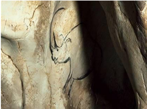
Figure 5. The interplay of lights and shadows, Cave of Forgotten Dreams , 2010

Additional aspect of the cave art involves portrayals of scenes that suggest mythic, supernatural and shamanic themes. One of the prominent paintings that imply a mythic or ritualistic function is named: Venus Pendant (Figure 6). The painting hangs on a rock formation that extends from the ceiling and is flanked by compositions of animals. It portrays a hybrid entity, half-human and half-bison named: The Sorcerer (Figure 6). The creature is mounting a woman's lower body whose pubic triangle and vulva are highlighted. The image is perhaps symbolic, related to a fertility rite, or perhaps depicting a relationship between a goddess-like woman and an animal spirit in a man's body. According to Lewis-Williams & Clottes, the half-human and half-bison is probably a therianthrope made of a combined image of a shaman and his spirit-animal guide (Lewis-Williams & Clottes, 1998, p.19).