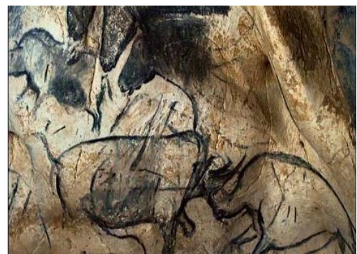
Figure 2. Fighting Rhino and Horses , Cave of Forgotten Dreams , 2010