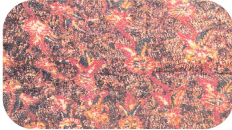
Figure 3. Batik Kendoro Kendiri Ukel.