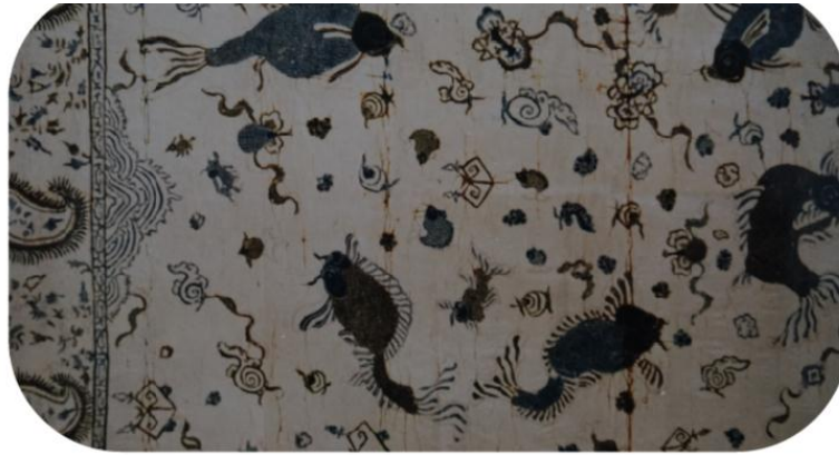
Figure 2. Batik Lasem Penutup Pintu Lokcan.(source: Dinas Perdagangan, Perindustrian, Koperasi dan UMKM Rembang, 2018)

Analysis of sign meanings, individually and in groups, on batik as text can be seen in the following table.