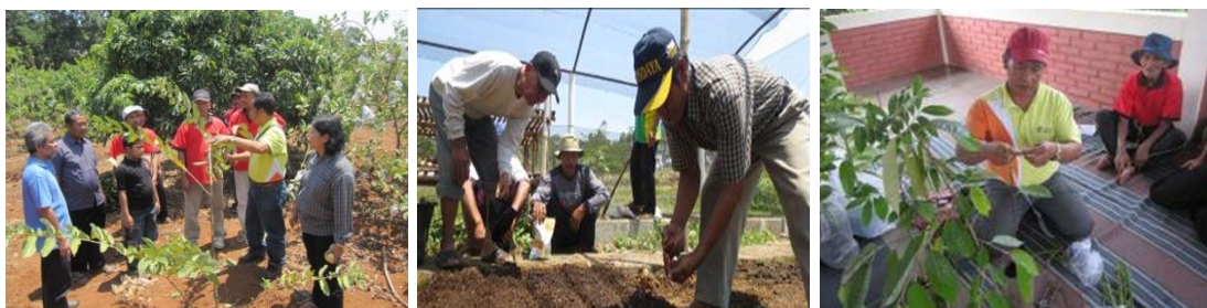
Figure 3. Horticultural Agribusiness Field School

Field school activities were conducted four times, where each meeting is 240 minutes and began with pre-test and post-test. To support field activities, a mentoring program was carried out which was integrated with the higher education school and a Focus Group Discussion with related stakeholders. The level of farmer participation is high because they immediately get the benefits. This is in line with the field schools in Palopo, showing the positive attitude of farmers to the SL Program. This attitude is influenced by farmers' knowledge of the program or other knowledge related to the program. Knowledge or information obtained by farmers about the program or activities in the program is considered good enough, whether it is obtained from personal experience or information from others (Digest, 2017).