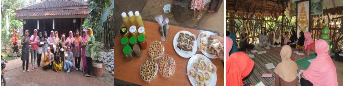
Figure 4. Horticulture-Based Process Industry Entrepreneurship Training

Optimization of the functions of ATP Agro Purwosari in the field of Tourism is also carried out through field schools with the aim of transferring knowledge as well as practices to improve skills to Edu-agro-tourism. In the Edu-agro-tourism field school, participants participated in learning and practice activities in the field for 4x meetings (4x6 hours). The learning material includes an arrangement of tour packages, guiding techniques, disposition of SOPs, and performing arts. The activity was facilitated by a website development assistance program, making leaflets/booklets and organizing local scale events by the academics majoring in economics and arts and culture.