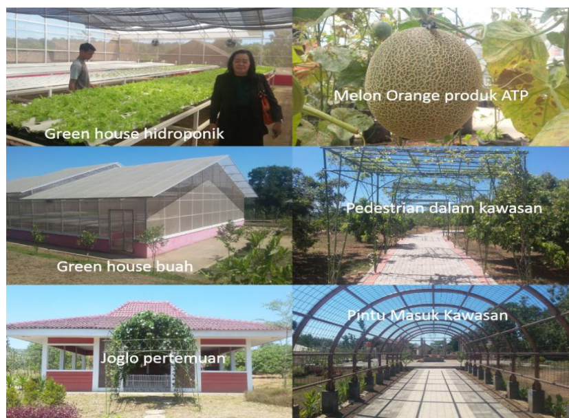
Figure 2 Supporting facilities and infrastructure of Purwosari ATP

The Government of Semarang, through its Agriculture Department has started the construction of Purwosari ATP since 2018 using 2017-2019 Local Budget Expenditure (APBD). It comprised of 17.89 ha of various plant development which is managed collectively by members of KT Mbangun Karso (50 members), KT LohJinawi (66 members), and KT Subur Makmur (30 members). So far, the development that has been carried out is the construction of parking areas, lavatory, pedestrian, hydroponic greenhouse, fruit and vegetable greenhouse, and joglohermitage.