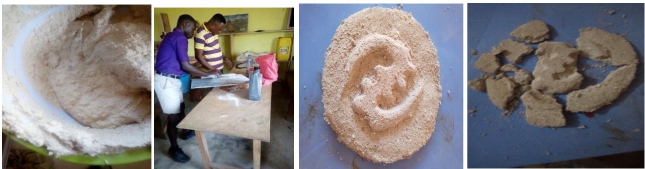
Figure 11: Eggshell powder and wheat flour as a binder for casting

Clay was used to model sculpture figure (Gye-nyame) and plaster of Paris (P.o.P) was used to make a mould in order to cast the sculpture figure. Eggshell powder and wheat flour was mixed together and was poured into a mould in order to solidify. A detail in the mould was copied by using wheat flour to cast. (See figure 11)