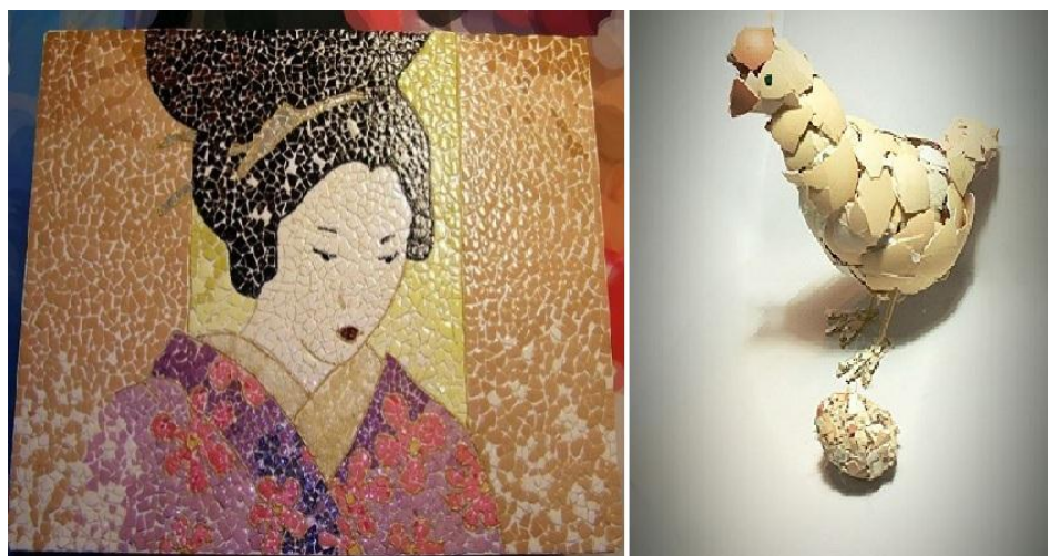
Fig. 1: Mosaic Art, Artist (Anonymous), source: flickr.com, Fig. 2: Eggshell Sculpture, Artist (Kyle Bean)

Source: https://kylebean.co.uk/portfolio/whatcamefirst