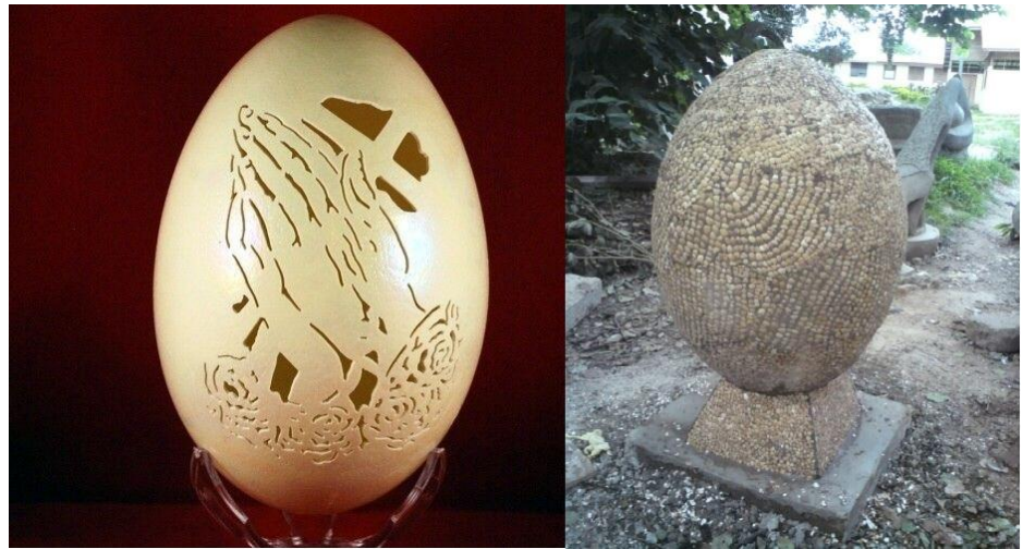
Fig. 3: Eggshell Carving, Artist (Ron Cheruka), Source: https://fractalenlightenment.com

Binders are very useful in making materials to adhere together when creating artifacts. Some liquid binders can dissolve materials from powdered to solid state, binders simply refer to Liquid substances that harden by a chemical process and binds fibers, filter powder and other particles added into it. Binders or Adhesives as a means of bondage has been used