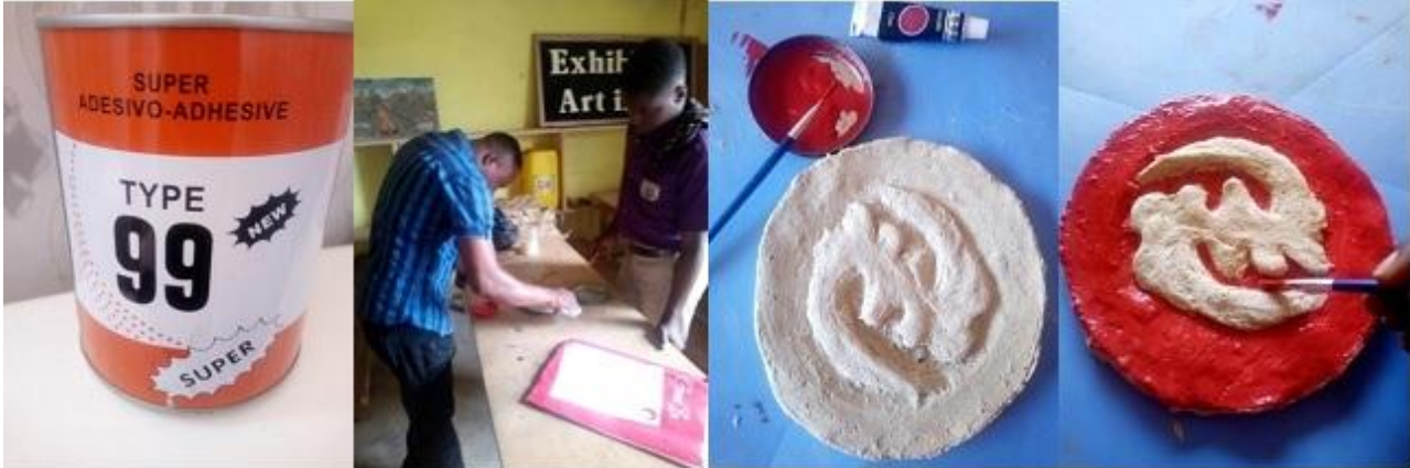
Figure 12: Eggshell powder and Super Adesivo Adhesive as a binder for casting A: Super Adesivo Adhesive, B: casting process, C: Gye-nyame symbol, D: Finishing of Gye-nyame symbol

into a mould in order to solidify. Details in the mould were copied by using super Adesivo adhesive as a binding agent for eggshell powder. (See figure 12)