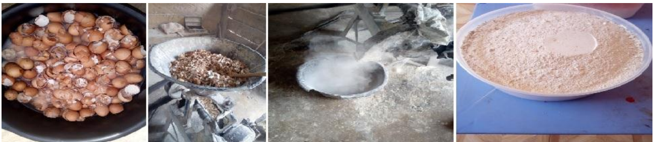
Figure 6: Processing of shells into powder