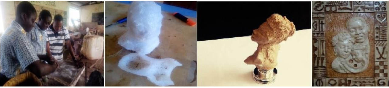
Figure 9: Casting with eggshell powder and resin

A: mixture of eggshell powder and resin for relief sculpture, B: silicon mould for casting, C: portrait, D: relief figure composition (unity)