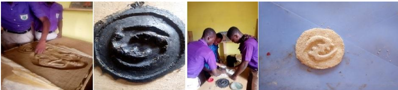
Figure 8: students modeling and casting with eggshell powder and cassava starch A: Clay work, B: Silicon mould, C: mixture of eggshell powder and cassava starch, D: cast piece (Gyenyame symbol)

The second objective was to introduce students of W.B.M Zion Senior High School to the process of making sculpture figures out of eggshell powder with selected binders. The researchers selected students based on their skills in modeling and casting and introduced to them the processes involved in using eggshell powder as a viable material for modeling and casting. The students had to be given a detailed explanation on what they were about to do and its relevance. The researchers grouped students and each group was to model and cast with eggshell powder and a selected binder. Group A, experimented with eggshell powder and cassava starch under the supervision of the researchers. Students were introduced to the preparation of starch binders by peeling and washing of cassava, rasping cassava, dewatering the grated cassava and using it to cook starch. Clay was used to model sculpture figure and silicon was used for the mould in order to cast the sculpture piece. Eggshell powder and cassava starch was mixed together and was poured into a mould to solidify. A detail in the mould was copied by using starch as a binder. It took three days for the cast piece to be separated from the mould. The process is seen in figure 8.