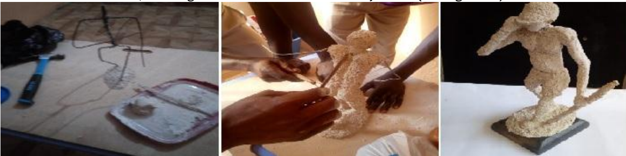
Figure 10: Direct modeling with eggshell powder and white glue as a binder

Armature was constructed for modeling human figure (the hunter) and mixture of eggshell powder and white glue was directly applied on the armature to build a form. Since the nature of the material was malleable, building of the human form was easily done. (See figure 10)