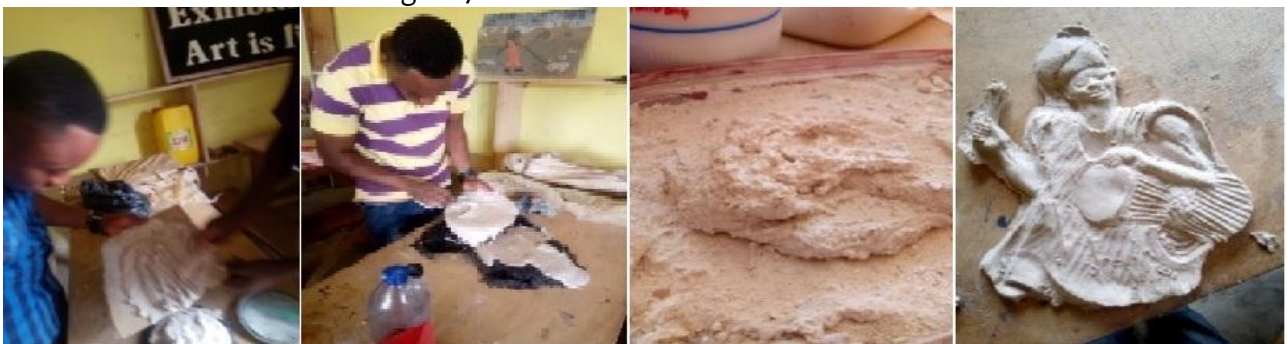
Figure 7: Modeling and casting with eggshell powder and selected binders

The first objective of the work was to experiment with eggshell powder and selected binders to serve as a viable material for modeling and casting in W.B.M Zion Senior High School. The researchers converted eggshells into powder for modeling and casting, the powdery material was experimented with selected binders such as white glue, cassava starch, wheat flour starch and super Adesivo adhesive. A study into the preparation of natural binders gave the researchers idea of how binders are prepared to hold particles. Clay was used to model figures and mould was prepared for casting to take place after the experimentation of the powdery material and the selected binders. Experimenting with eggshell powder and selected binders is seen in figure 7.