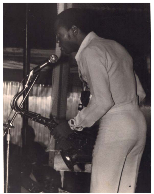
Fela performing at the African shrine, Ikeja Lagos.

emancipation in some of the world's slum- the African slum. He concluded that his songs affirm the authentic African traditional culture and decry the present day degradation of black African culture and the ordinary people. Ultimately, the confluence of dance, theatre and its paraphernalia helps to a high degree in better interpretation of lyrics and subsequently transfers such to the waiting audience.