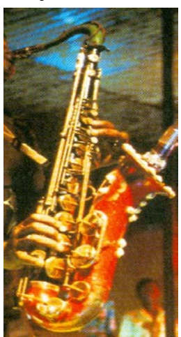
Fela's tenor saxophone decorated with cowry shells.

The musical instruments provide aesthetic and also serve as objects of beauty during performances. This is in tandem with the point made by Nketia (1982:27) that the visual aspect of performances in Africa is manifested in the decoration of musical instruments. He observed that the visual display extended to the musical instruments like the artistic configuration of the drums. There are some instruments in Afrobeat ensembles that are decorated with designs and carvings that portray artistic aesthetics of African people. An example is Felá's tenor saxophone decorated with cowries and shells.