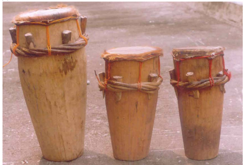
The African conga

The African conga drums are replicas of the standard conga. They are a set of three drums, semi cylindrical with slight narrowing at the tail end and covered by a membrane. The smallness of frame and narrow cavity account for the light quality of sound and high range of musical notes produced. Playing is normally done with both hands while standing. A prominent feature of the drum section of Afrobeat, the instrument is played only by Fela.