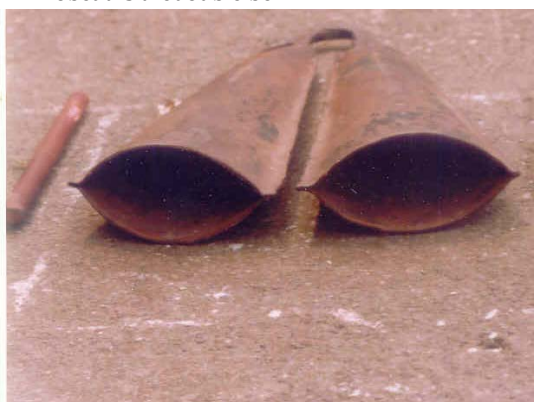
The Agogo (Double bell)

This instrument belongs to the category of directly struck idiophone. It is constructed by blacksmiths from molten iron, which is heated and moulded to a conical shape with an elongated handle. The Yorubas have varieties of bells ranging from single to double, triple and quadruple metal gongs. The agogo is held with the left hand and struck with a stick beater with the right hand either from a sitting or standing position. The common bell used in Afrobeat is the double bell: