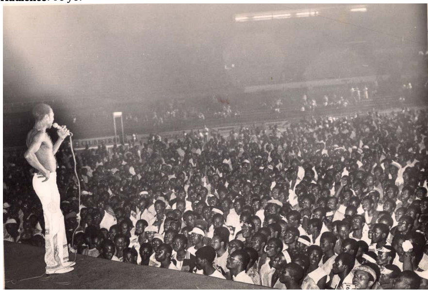
Thousands of Fela's supporters listenning to his "yabis" during his show at the national stadium Lagos. 1986.