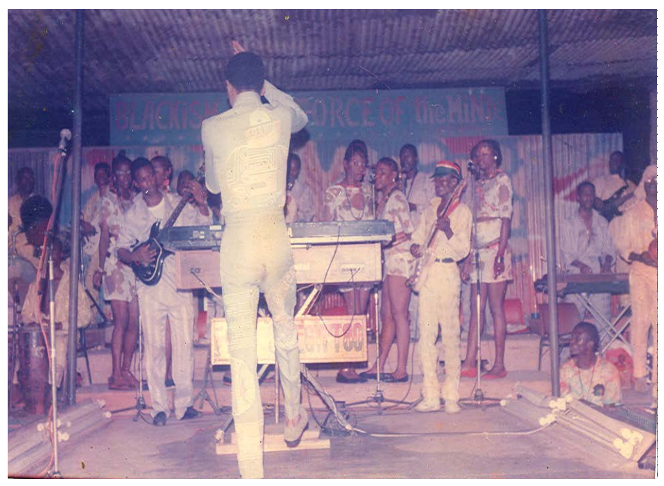
Felá in a rehearsal session with the Africa 70 band.

Closely related to the extra- musical features of Fela's performance are the costumes worn by the band. Fela's costumes were very creative and exploratory. They had certain features which were iconic and emblematic but never the same for all situations. At some times the male and female members of the band are costumed in orange colour soft cotton. At other times they are clad in other colours with a linear design and the map of Africa stamped on the outer edge of each trouser and shirt.