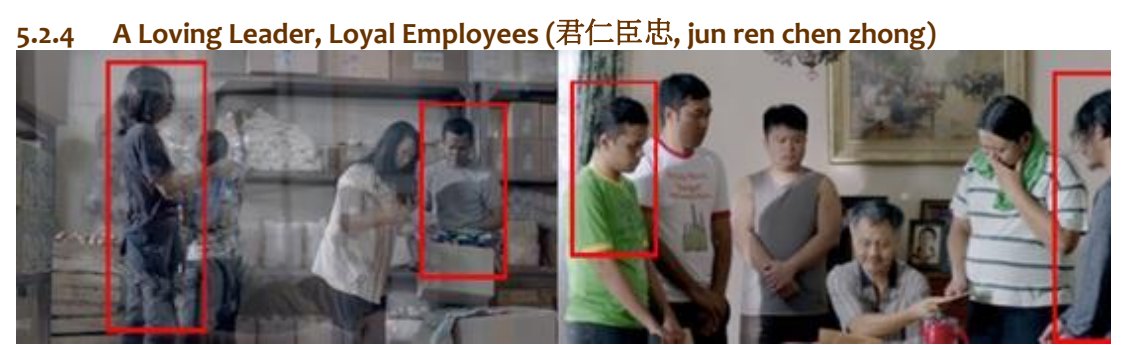
Figure 10: The scene of wise treatment of employees by boss and the loyal employees.

Confucius taught that as young or old brothers, should be good friends. The younger brother should be respectful to his older brother. In this film, the sibling relationship is shown. After the quarrel, the younger apologizes to his brother. Teamwork of siblings managed to retrieve the land letter from the developer who had already signed by their father. The younger brother who was respectful and amazed at his brother, even though the economic condition of his younger brother was more successful than his older brother. Siblings are must love one another. The Younger Must Respect the Older to realize happiness and family unity. Respect is a word that means not just respect, but respect that is accompanied by a sense of awe or sympathy. Scenes in this film to be an inspiration, in order to maintain the integrity of the State, in social life must respect each other's differences based on the awe of "Bhinneka Tunggal Ika" as Indonesia's local wisdom.