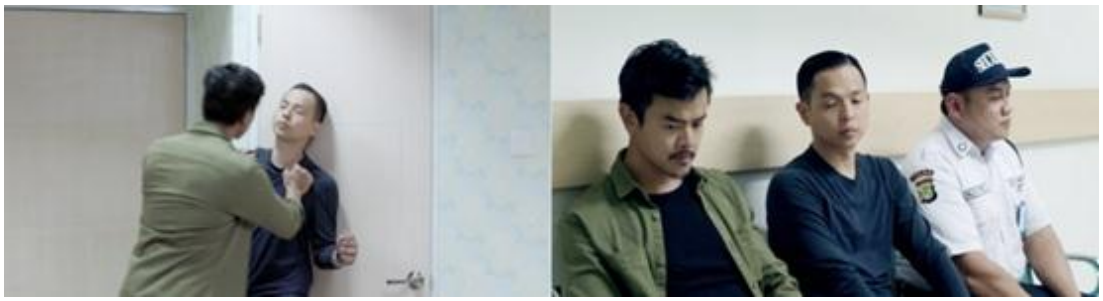
Figure 8: The scene of the younger brother apologized to his brother, after they quarrel.