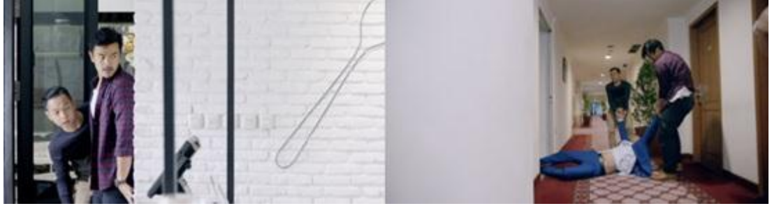
Figure 9: The scene of cooperation of siblings.

Confucius taught that as young or old brothers, should be good friends. The younger brother should be respectful to his older brother. In this film, the sibling relationship is shown. After the quarrel, the younger apologizes to his brother. Teamwork of siblings managed to retrieve the land letter from the developer who had already signed by their father. The younger brother who was respectful and amazed at his brother, even though the economic condition of his younger brother was more successful than his older brother. Siblings are must love one another. The Younger Must Respect the Older to realize happiness and family unity. Respect is a word that means not just respect, but respect that is accompanied by a sense of awe or sympathy. Scenes in this film to be an inspiration, in order to maintain the integrity of the State, in social life must respect each other's differences based on the awe of "Bhinneka Tunggal Ika" as Indonesia's local wisdom.