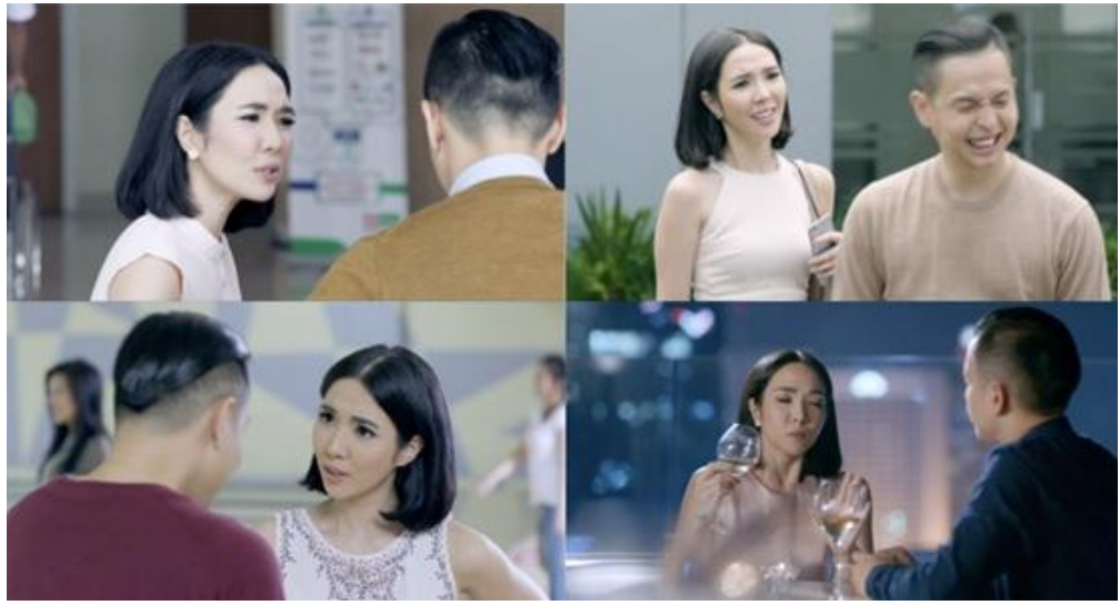
Figure 3: The scene of Natalie is Erwin's future wife that is selfish.