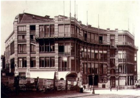
Figure 2: "House of the People" in Brussels

However, the expression of Gaudi's architectural curve language is not the first. "House of the People" is designed by Horta in Brussels. (Figure 2) He made use of stone, iron, glass and Belgian brick with matching the external shape of the building as the concave contour of the rules curve, which was also the typical characteristics of his architectural design. The outside shape of Casa Mila produced the curve contour of the general curve of the wave type like sea waves. (Figure 3) The internal shape of its curve is applied from different kinds of animals and plants in nature. It can be said that the curve of the organic form of Casa Mila makes Gaudi's design more inclined to naturalization.