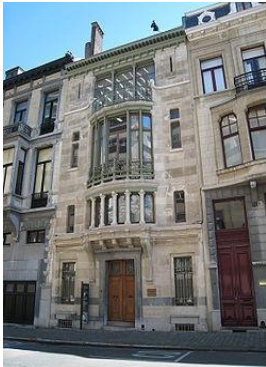
Figure 5: Tassel Hotel

Tassel Hotel is more typical architecture in Art Nouveau, which its characteristic of the internal and external structure of the construction is relatively simple. The exterior styling of Tassel hotel is mainly in the straight line and the plane. On the contrary, the interior of the hotel is decorated with curves. Staircase handrails are built with a certain radian, and filled with the hook shape of curves in the interior of hotel, which steps is designed into a circular arc shape, and decorative patterns of grounds and walls adopt the source nature of curve image, and the decorative abstract lines are arranged on the edge of the roof angle, even pillars displaying all forms with the curve of the tendrils in nature (Qijun, 2009).