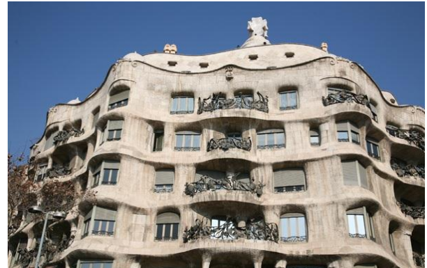
Figure 3: Casa Mila