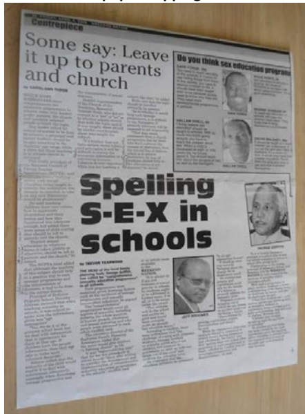
Fig. 2. Weekend Nation. "Centerpiece" Friday April 4, 2008. 28.