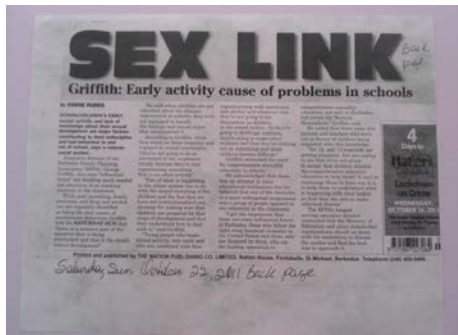
Fig. 3. Sunday Sun. "Sex Link..." October 22, 2011. Back page.