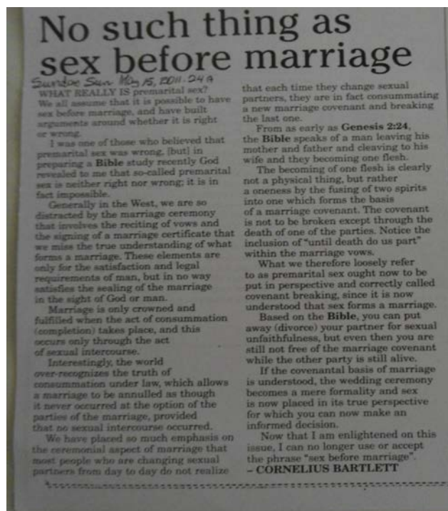
Fig. 1. Sunday Sun May 15, 2011. 24A.

The role of the above newspaper report is to emphasize the entrenchment of hegemonic discourses about human sexuality in Barbados. This report is one of many coming after a statement ran in the Daily Nation on May