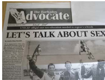
Fig. 4. The Barbados Advocate. Wednesday April 15, 2009. Back page.