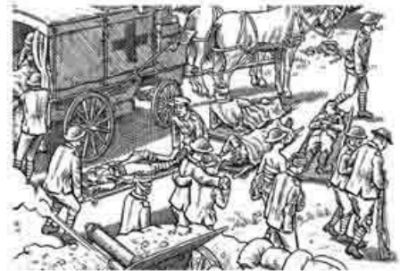
Figure 10: Stretch-bearers carry the wounded in Dix's Transporting the Wounded in Houthulst Forest (Left) and Sacco, 2013, N/A (Right), (from The War (Der Krieg) portfolio reproduced in The Museum of Modern Art, New York (Web) (Left) and detail of The Great War

relying on his research of the First World War, portrays scenes that Dix had witnessed and later depicted in The War (Der Krieg) . If stretch-bearers are carrying away badly wounded soldiers on the British side in Sacco's The Great War , so do the German stretch-bearers in Otto Dix's Transporting the Wounded in Houthulst Forest (Fig 10). And the depiction of bodies of soldiers tangled in the barbed-wire in Dix's Dance of Death , are as harrowing as bodies torn apart between trenches in Sacco's The Great War (Fig 11