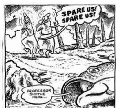
Figure 1: The fish in Bruegel's Big Fish Eat Little Fish (Left) and Sacco's 'Apocalypse, Then' (Right) (Bruegel Reproduced in Sellink, 2007, p.88 and detail of 'Apocalypse, Then' in Spotlight on the Genius that is Joe Sacco p.43 (Right).