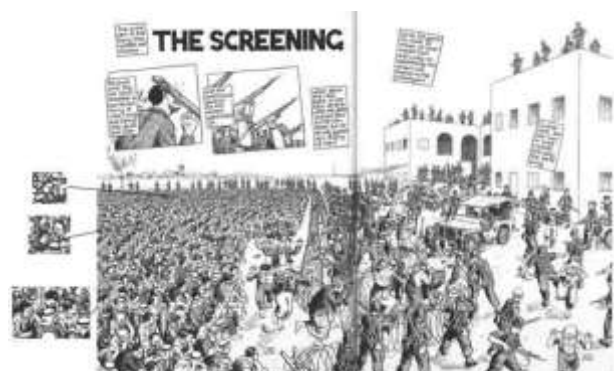
Figure 7: Sacco emphasizes the individuality of ordinary people in Footnotes in Gaza (Sacco, 2007, pp.298-9 (Right) and detail of the same (Left) ).

It is a point also manifested in many of Bruegel's works. As we saw in Massacre of Innocents , Bruegel takes great care to depict figures in his paintings as individuals, especially those from lower social status