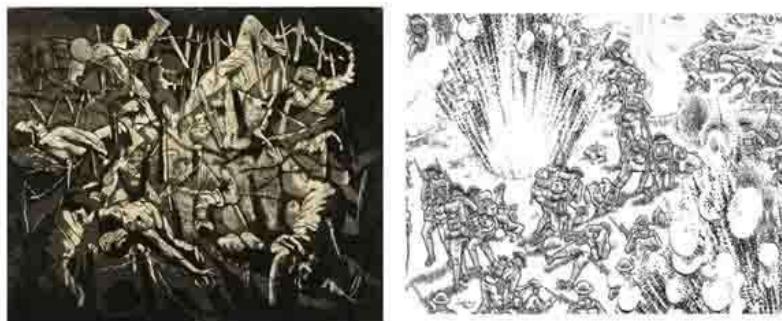
Figure 11: Bodies lie between trenches in Dix's Dance of Death and Sacco's The Great War , (from The War (Der Krieg) portfolio reproduced in The Museum of Modern Art, New York (Web) (Left) and detail of Sacco, 2013, N/A (Right)).

This sense of madness and surreality, which Dix unreservedly portrays in wounded soldier and Shock Troops Advance Under Gas is also present in a double-spread page at the beginning of Sacco's latest work Bumf (2014), where, in a chaotic battleground, soldiers are fighting among the skeletons of their comrades (Fig 12). At the background, soldiers wearing gas masks are taken down one after another as they mechanically advance in a row. And in the chaos ensued in the front of the panel, the shock in the eyes of a terribly wounded soldier is a shadow of the expression on the face of the badly hurt soldier that Dix portrays in the wounded soldier .