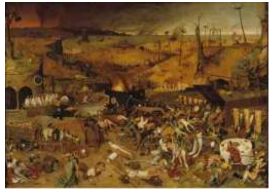
Figure 5: The Triumph of Death by Pieter Bruegel (Reproduced in Sellink, 2007, p. 176).

in none of these earlier images of death, however, do the dead fall upon the living in such overwhelming numbers, nor do they comport themselves in such an orderly, military fashion. Indeed, Bruegel's Triumph of Death seems to parody the battle scenes which were so popular with his contemporaries... (p.116)