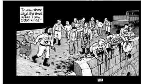
Figure 3: Little boy and his family brought to be slaughtered in 'Around Goražde' (panel 4 (Left), panel 6 (Right)) (Detail of Safe Area Goražde , Sacco, 2011, p.110)

What stands out in both Bruegel and Sacco's works is the helplessness and agony of the families; they are present but have no means to stop the bloodshed or to save their children.