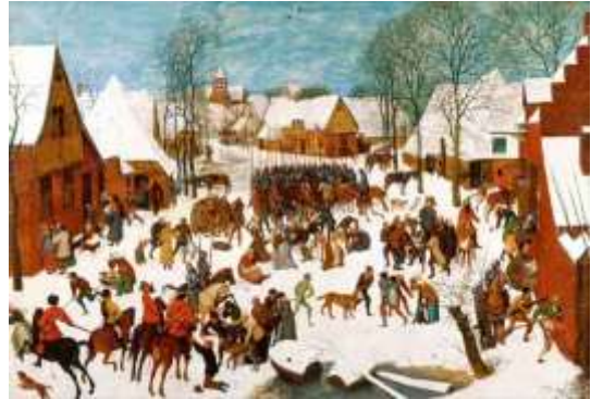
Figure 2: Massacre of Innocents by Pieter Bruegel (Reproduced in Sellink, 2007, p. 234).

Arguing that the way in which Bruegel's contemporaries could have interpreted the painting is more relevant than the (unknown) intentions of the painter himself, Kunzle proposes that the work should be seen primarily as an explicit criticism of Habsburg repressive politics. (p.235)