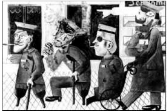
Figure 9: Otto Dix's unheroic depiction of war veterans in War Cripples (Dix reproduced in The Museum of Modern Art, New York (Web)).

the horrible suffering of the soldiers features as many as eight times in Dix's work, and in decidedly major works at that, such as The Trench , 1923, the Metropolis triptych, 1927-28, and the War triptych, 1932...while war cripples were a common sight on the streets, or even in people's personal environment...they were still uncommon as a subject of art. (Spanke, 2013, p.18)